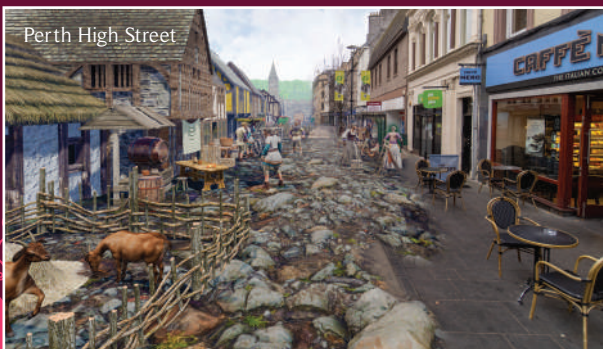
Perth High Street