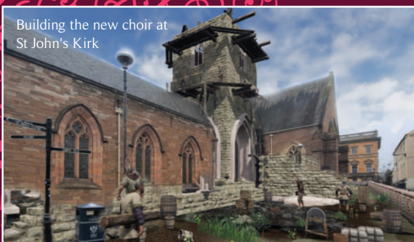
Building the new choir at St John's Kirk