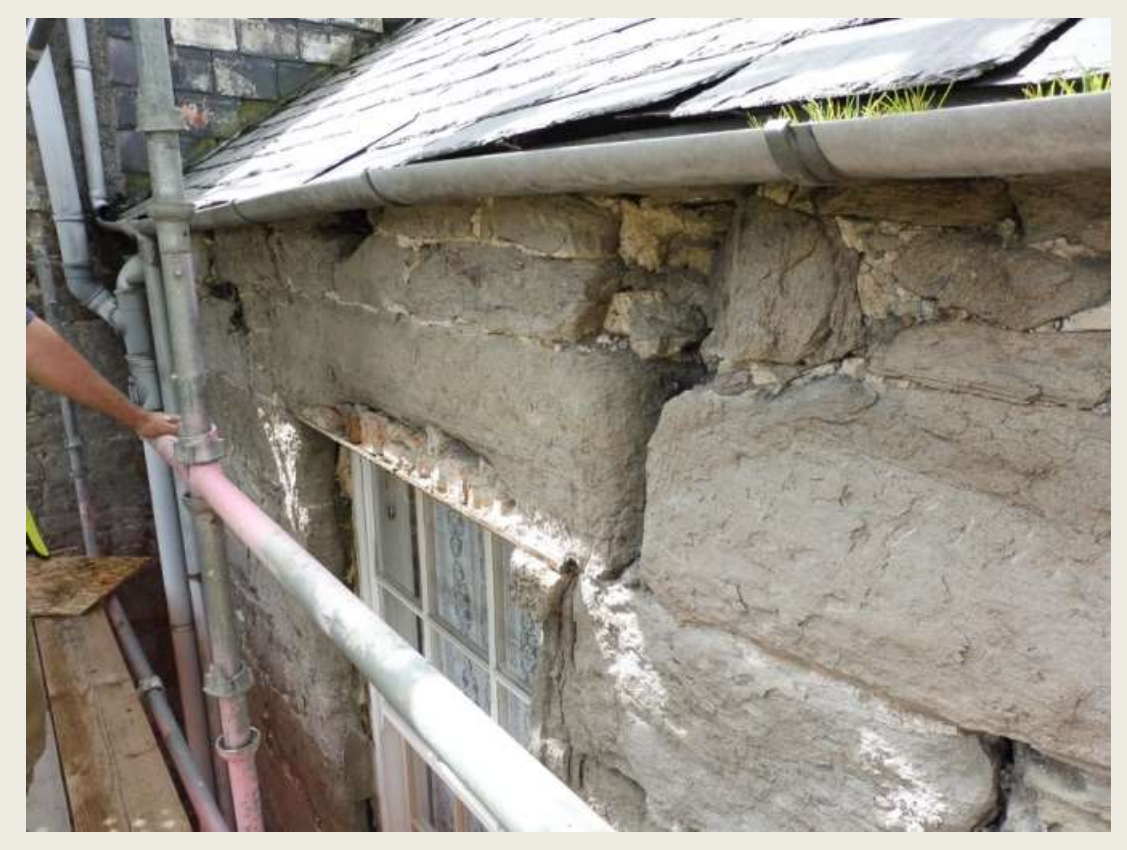
During works (2017)