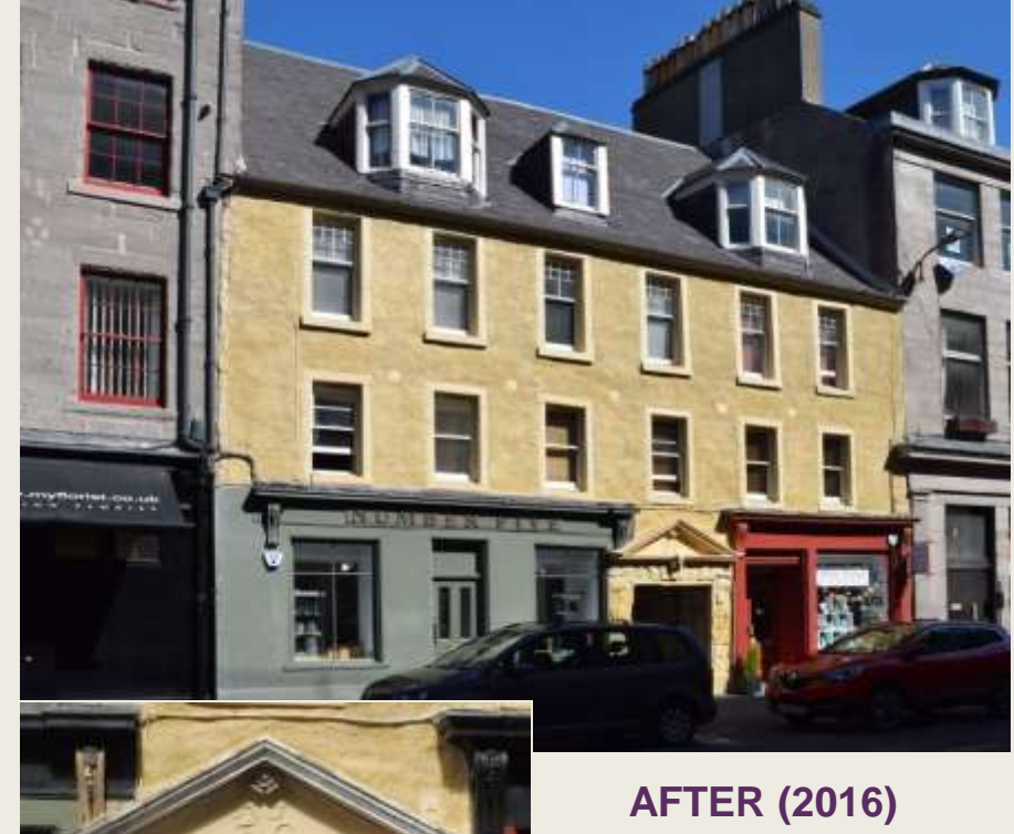
Perth City Heritage Fund