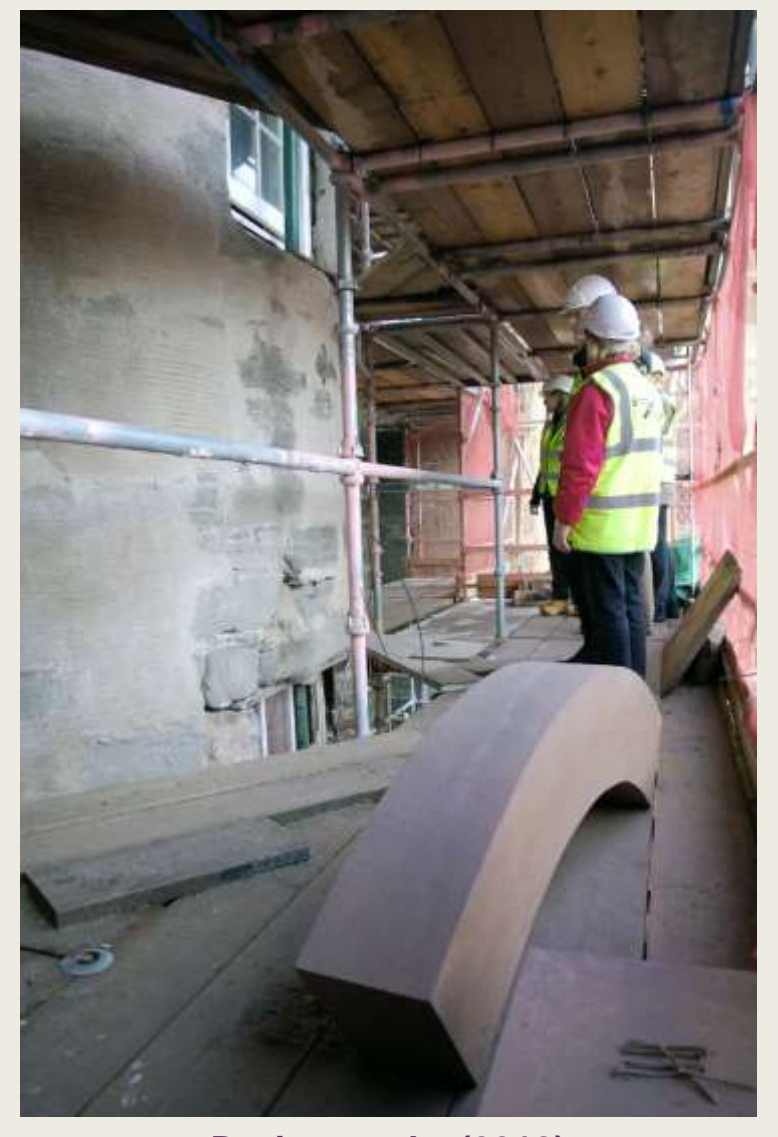
During works (2018)