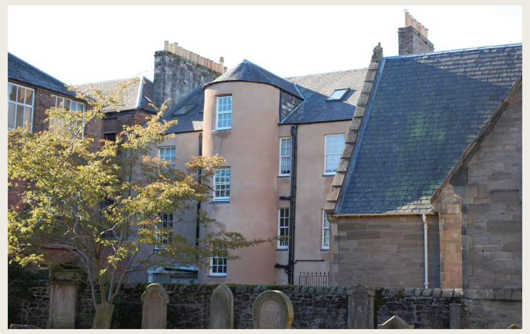
NEARING PRABEIFORIE (2017) LETION (2018)