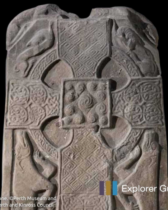
St Madoes Stone.