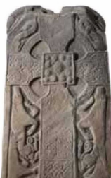
St Madoes Stone.

The place name St Madoes derives from the name of a 6th century AD Irish Christian saint, Aedán, in its intimate nickname form of Mo Aedóc ('my Aedán'). The presence of a churchband Pictish sculpture in St Madoes reflects the later spread of the cult of Aedán rather than any personal visit by the saint. The church was built on the site of an extensive Bronze Age and later cemetery, partly to make Christian an already sacred, pagan landscape.